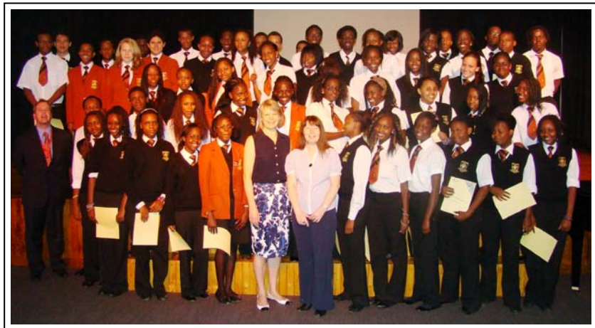
Aston University delegates handed certificates to our Year 10 and 11 students